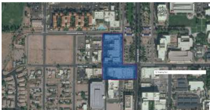
Historic commercial district, west of Arizona Avenue.