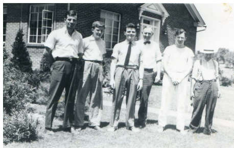
VCA Detwiler Animal Hospital, Reading, PA, Estab. 1921

Forms and worksheets can be found at http://www.AVMHS.org/heritage_application.html or requested by mail from the AVMHS address below.