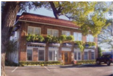
Rutherford Animal Hospital, Dallas, Texas, Estab. 1924