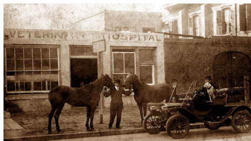
Case Veterinary Hospital, Savannah, GA, Estab. 1909