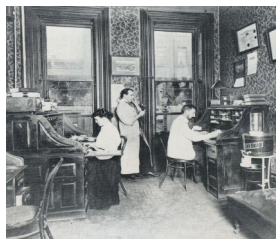
Miller-Clark Animal Hospital, New York, Estab. 1901

ments, recognize longevity, and share information about long-standing veterinary practices in America.