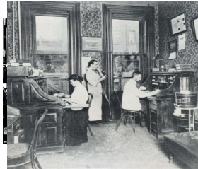
Miller-Clark Animal Hospital, New York, Estab. 1901

The American Veterinary Medical History Society is pleased to establish and sponsor the REGISTRY of