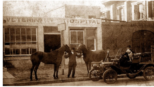
Case Veterinary Hospital, Savannah, GA, Estab. 1909

Certificates To supplement a heritage practice's Registry listing, AVMHS will provide an 8.5x11" certificate suitable for wall framing at no cost.