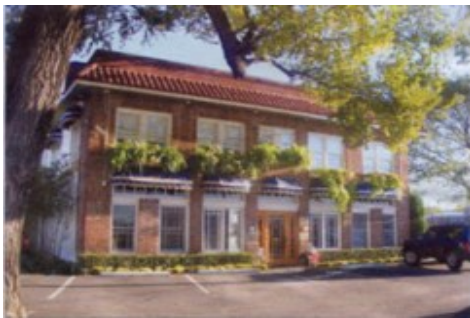
Rutherford Animal Hospital, Dallas, Texas, Estab. 1924