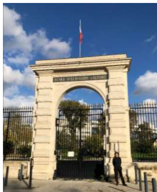
Gate of the Ecole Veterinaire d'Alfort near Paris.

After our river cruise ended in Lyon, we spent a few days in Paris. The Musée Fragonard is located on the campus of the National Veterinary School at Alfort. It is one of the oldest in the country and easily accessible from downtown Paris via the metro.