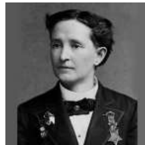
Dr. Mary Edwards Walker.