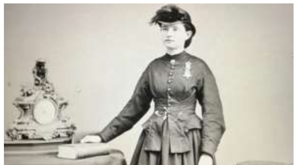
A photo by Mathew Brady of Dr. Mary Edwards Walker circa 1866, shown wearing her Medal of Honor.

Background on Dr. Walker can be found at: