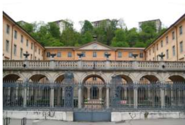
View of the Courtyard.

The statue below was visible through the gate.