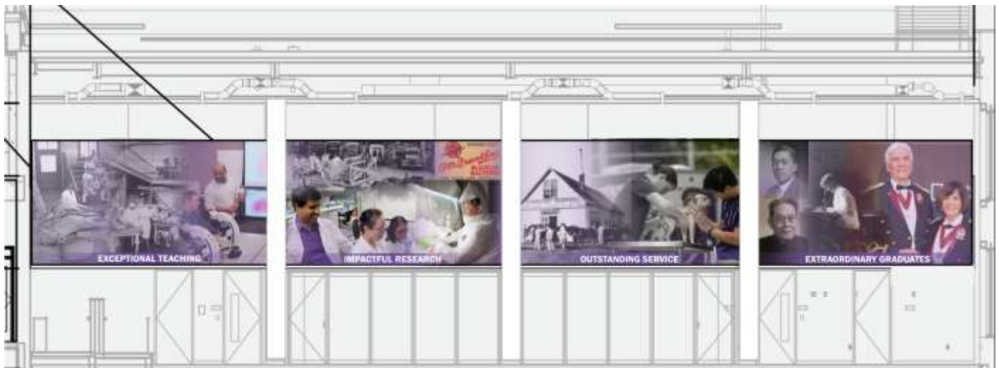
Architectural elevation drawing of wall of auditorium entrance produced by Eisterhold Associates, Inc. Provided courtesy of Kansas State University College of Veterinary Medicine.