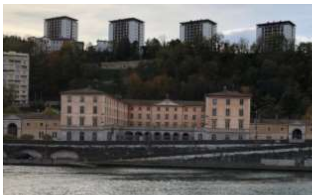
View from the far side of the Saones River in Lyon, France.

We were on a tour bus excursion when our guide pointed to a building and said that it was the National Conservatory for Music and Dance. She also mentioned that the building originally sheltered the Convent of the Sisters of St. Elizabeth (17 th century), and after the Revolution, it became home to the first Veterinary School in France and in the world.