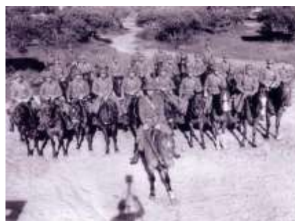
2nd Platoon, B Troop, 107th Cavalry, 1942 Fort ORD California.

1942 http://freepages.rootsweb.com/~gregkrenzelok/genealogy/veterinary%20corp%20in%20ww1/fort%20ordequestriancenter.html